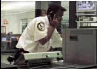
On-premises Security Officers