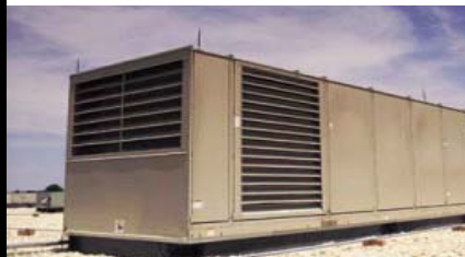
Redundant HVAC Control Environment